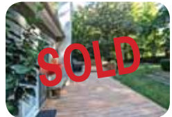
Vaulted! Great deck/yard! $259,900