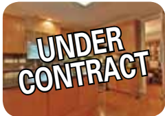
Belle Meade! 5 BR+++ $300,000