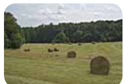
27 ac! Bring a horse! $127,500