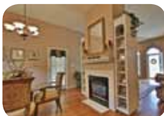
Immaculate and spacious! $179,900