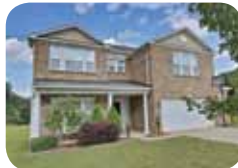
Living space galore! Fresh! $225,000