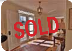
European-inspired elegance $570,000