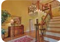
Country Club area! 5 yrs old! $550,000