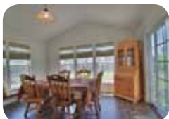
Entertain in & out! Great flow! $187,500