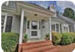
Updated! Fresh! Spacious! $250,000