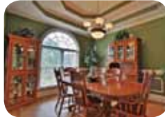
Well-appointed! Grand! $350,000