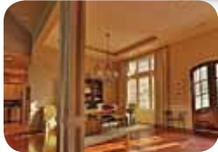
French country style AND lake views! $669,000