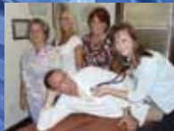
Belmont Chiropractic Staff