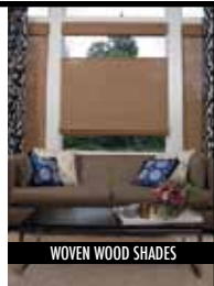
WOVEN WOOD SHADES

All popular Budget Blinds window coverings can be motorized by Somfy®