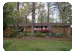
Woodland Park! Basement! $164,500