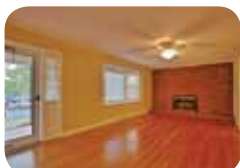
2 master suites! 2 living areas! $154,900