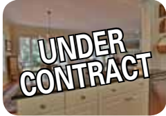
Elegant! 3BR on Main! $379,900