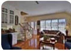
Extended garden! Vaulted areas! $298,500