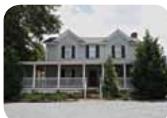
Commercial! Charming! $149,900