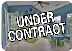
Walk to pool! Vaulted sunroom! $260,000