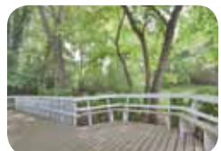
Crisp! Fresh! Updated! $159,900