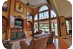
Grand & Open! $315,000