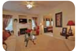
Pottery Barn feeling! Beautiful throughout! $198,500