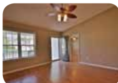
3-4 bedrooms! Convenient to I-85! $139,900