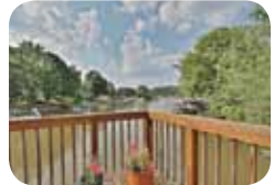
Waterfront! 2nd living quarters! $529,900