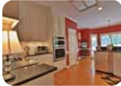
Glenfloor! Updated! 4BR+Bonus! $359,900