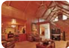
Feels like a mountain chalet! $230,000