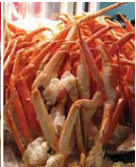
SNOW CRAB LEGS!