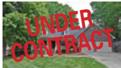
Enjoy the backyard from screened porch! 4BR! $227,500