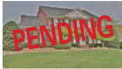
Walk to GCC! Private backyard! 5BR! $449,900