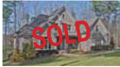
Misty Waters! Deeded boat slip! Over 5000 sq ft! $774,900