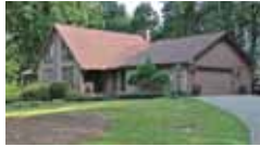
Stanley! Vaulted great rm! Granite in kitchen! Spacious! $249,900