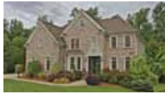
Glenmoor: Everything! Large lot! Unfinished basement! 5BR! $479,000