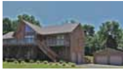
Overlooks beautiful lake! Ultimate retreat- everyday feels like vacation! $375,000