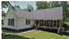
Great yard! Great living! Master down! 2 living areas! $149,900