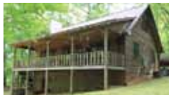
1.8 acres! Rustic Charm! $169,500