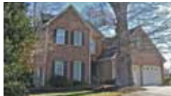
Stately Colony Woods! $179,900