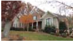
Executive 5 BR! St. Andrews $550,000