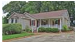
Vaulted! Open! Amazing! 3BR! Updated! $129,900