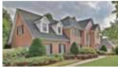
Elegant brick! Open living! 4BR+bonus! $359,900