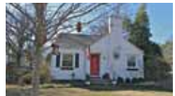
Charming! Hardwoods! Attic to expand! $84,900