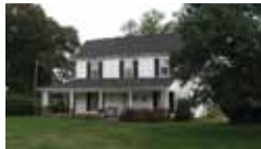
Vintage! 2nd Liv Qtrs! $179,900