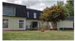
Waterfront! Docks UNDER deck! 2nd Living Qtrs! $569,900