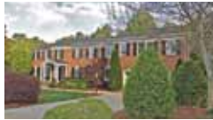
So much space! Huge bonus or media! 5BR! Vaulted sunroom! Private yard! $365,000