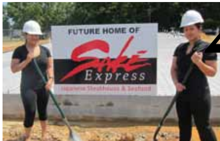
THOSE AMAZING SISTERS AT SAKE