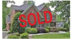
Cramer Mtn! 4 BR! Open and spacious! $399,900