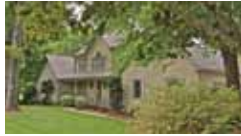
4 Bedrooms! Huge sunroom! Pool and outdoor living areas! $295,000