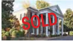
Belmont executive estate! $699,900