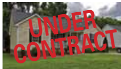
Mount Holly! Vaulted! 3 BR! Deck and porch! $114,900