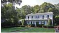
Amazing yard! Great closets! Balcony! 4 BR! $340,000