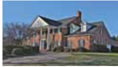
Live large! 5BR! 2 Bonus rms! Walk to GCC! $579,900!